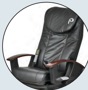
PS65-1 Black Chair Top