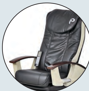
PS65-3 Black Chair with Beige Accents