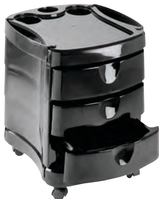
2045 PEDI-CART Length : 17" Width : 15" Height : 20"