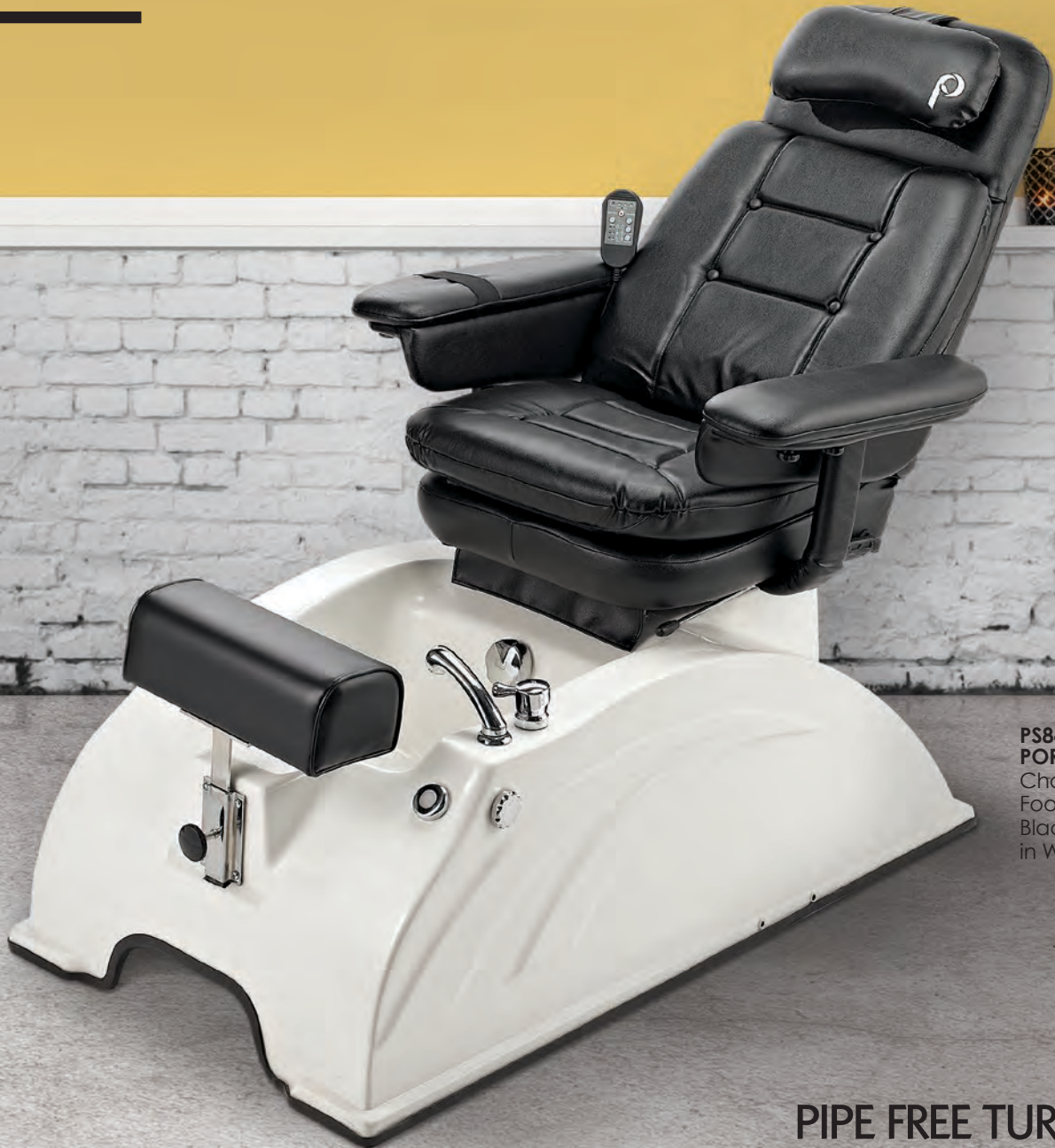
PS84A PORTOFINO Chair Top / Footrest in Black. Base in White.