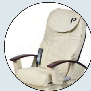
PS65-2 Beige Chair Top