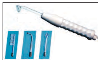
2931 High Frequency