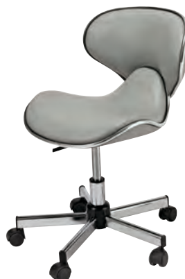
545 BUTTERFLY MANI PEDI CHAIR Width : 16" Height : 15"-18"