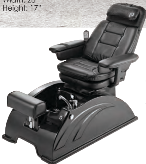
PS85A PORTOFINO Chair Top / Footrest in Black. Base in Black.