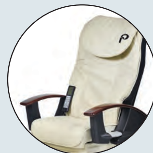
PS65-4 Beige Chair with Black Accents