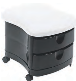
2030 Length : 17" Width : 15" Height : 15"