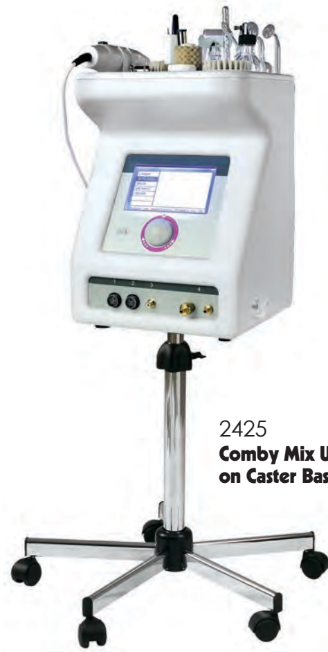
2425 Comby Mix Unit on Caster Base