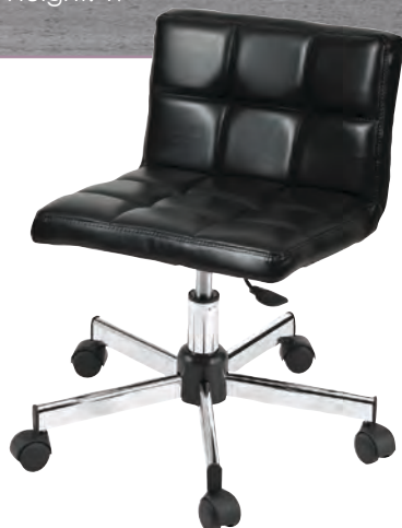
580BL WAFFLE PEDI CHAIR Black 580BL Fawn 580FN Adjustable Height 15"-18"