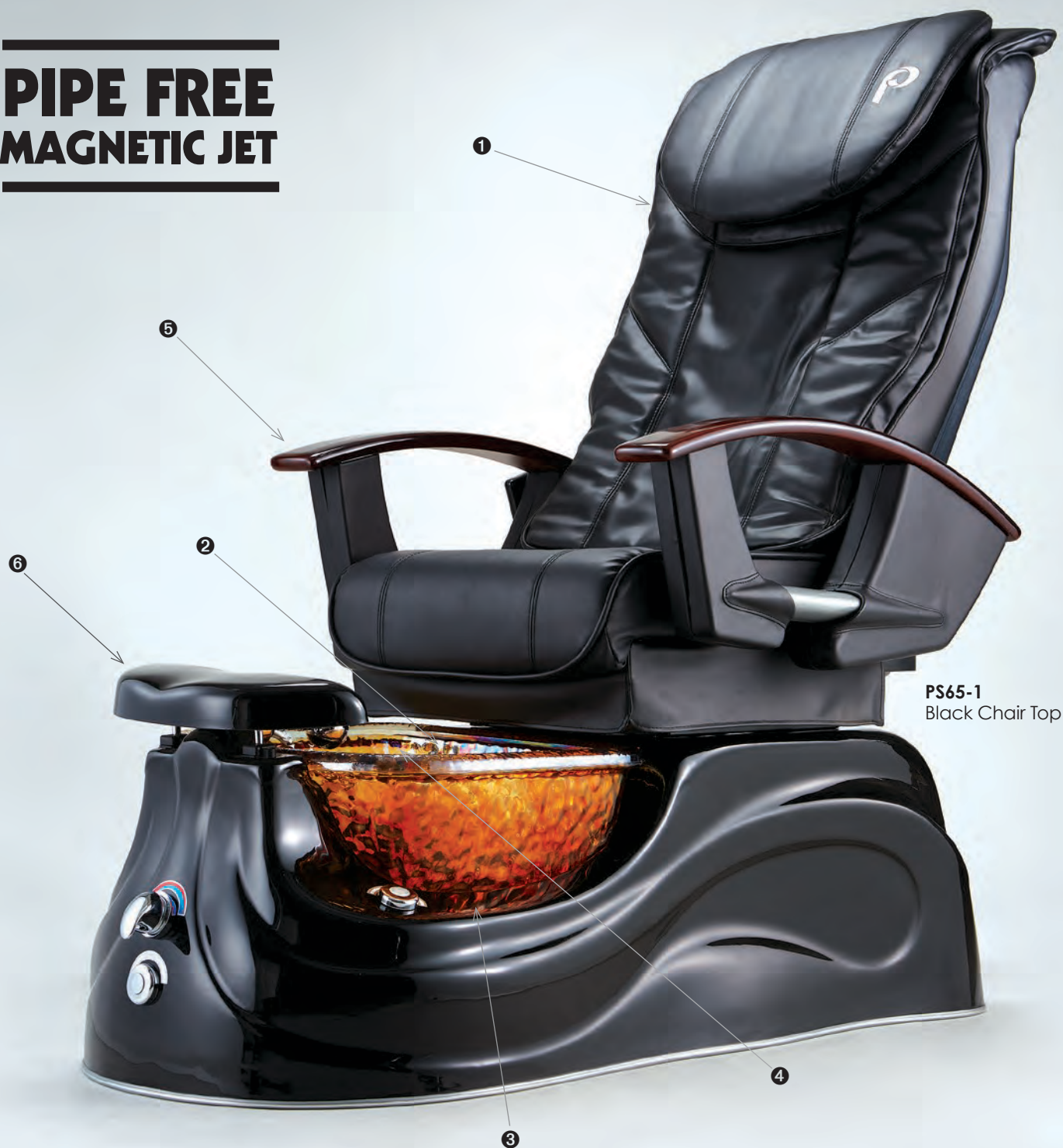
PS65-1 Black Chair Top

❶ Deep Kneading, tapping and rolling shiatsu massage