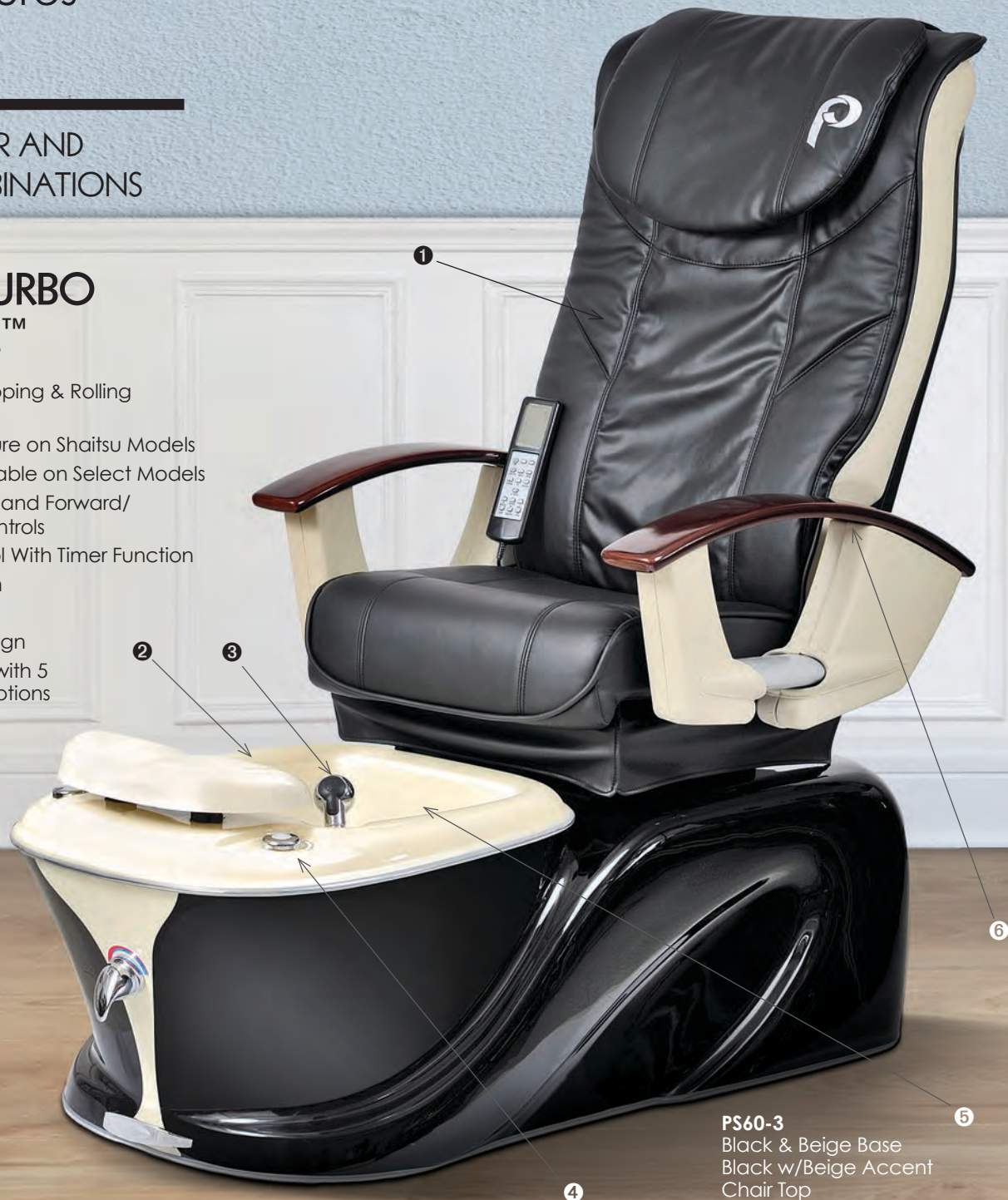
PS60-3 Black & Beige Base Black w/Beige Accent Chair Top

1 Unique, Integrating, Shiatsu System with Kneading, Tapping and Rolling Features