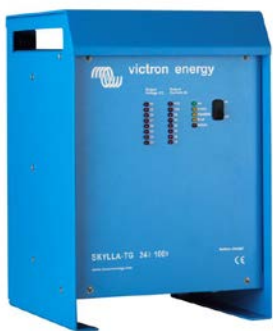
Skylla TG 24 100