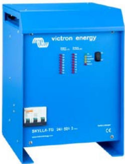
Skylla TG 24 50 3 phase

To learn more about batteries and charging batteries, please refer to our book 'Energy Unlimited' (available free of charge from Victron Energy and downloadable from www.victronenergy.com ).