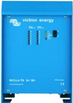
Skylla TG 24 50