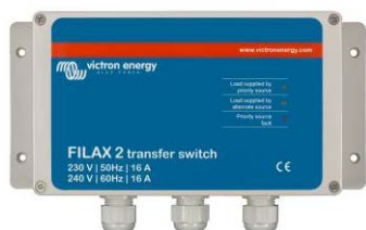
Filax 2: ultrafast transfer switch