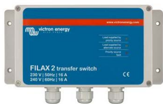
Filax 2: ultrafast transfer switch