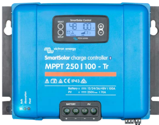
SmartSolar Charge Controller MPPT 250/100-Tr with pluggable display