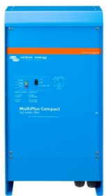
MultiPlus Compact 12/2000/80

When connected to the Ethernet, systems with a Color Control panel can be accessed and settings can be changed.