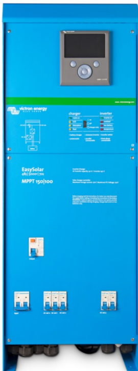
EasySolar 5 kVA

http://www.victronenergy.nl/support-and-downloads/software/