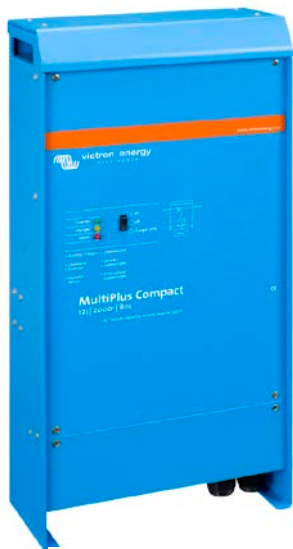
MultiPlus Compact 12/2000/80