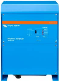
Phoenix Inverter 24/3000