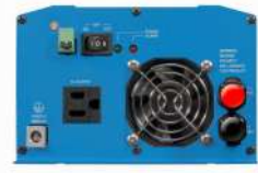
Phoenix Inverter 12/800 with Nema 5-15R socket