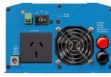
Phoenix Inverter 12/800 with AN/NZS 3112 socket