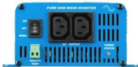
Phoenix Inverter 12/350 with IEC-320 sockets