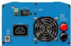
Phoenix Inverter 12/800 with IEC-320 socket