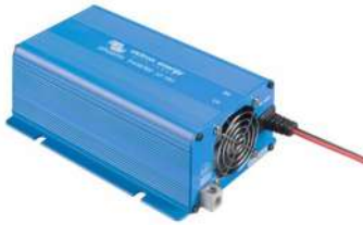
Phoenix Inverter 12/180