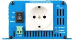
Phoenix Inverter 12/180 with Schuko socket