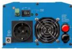
Phoenix Inverter 12/800 with Schuko socket