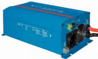
Phoenix Inverter 12/800 with Schuko socket

For our lower power models we recommend the use of our Filax Automatic Transfer Switch. The Filax features a very short switchover time (less than 20 milliseconds) so that computers and other electronic equipment will continue to operate without disruption.