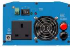
Phoenix Inverter 12/800 with BS 1363 socket