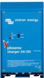
Phoenix Charger 24 V 25 A