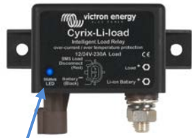
LED status indicator