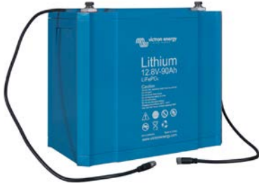
12,8V 90Ah LiFePO 4 Battery

Our 12V BMS will support up to 10 batteries in parallel (BTVs are simply daisy-chained).