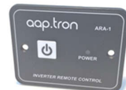
Remote Panel (Part No : ARA-1)