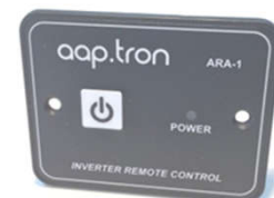
Remote Panel (Part No : ARA-1)