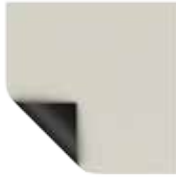
High Contrast Matte White