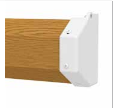
Light Veneer Case