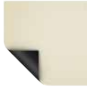
Video Spectra 1.5