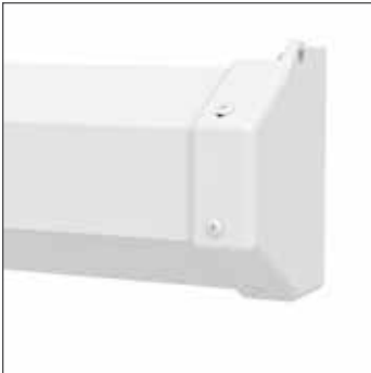
White Case (Standard)