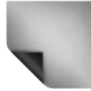
Silver Lite 2.5